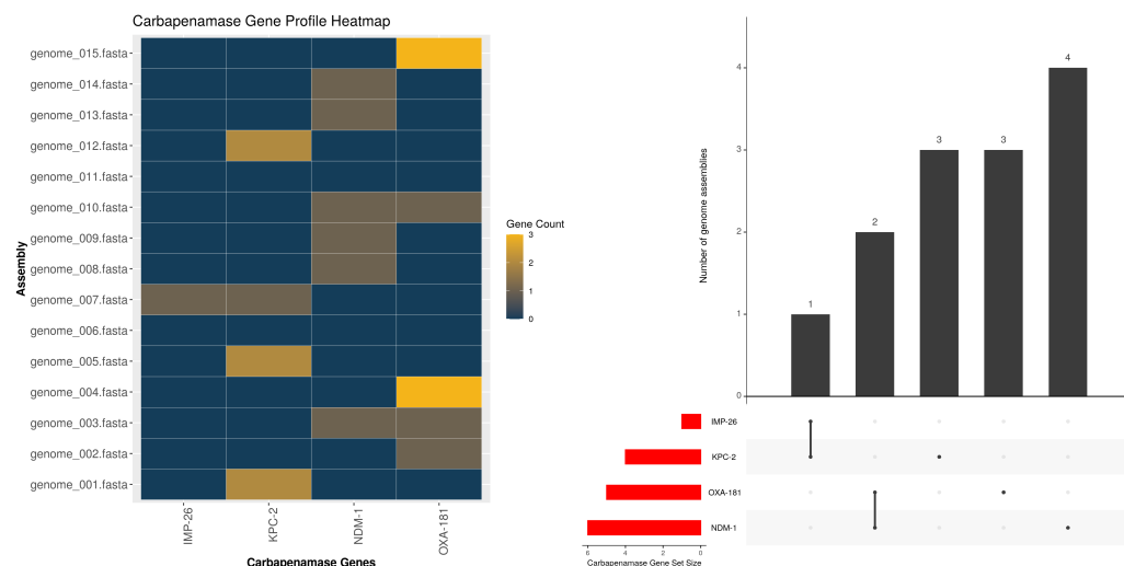
Figure 1. (A) CP gene profile obtained by 'cprofile' command (B) Set intersection plot of the available CP genes across genome assemblies, obtained by the 'upsetR_plot' command