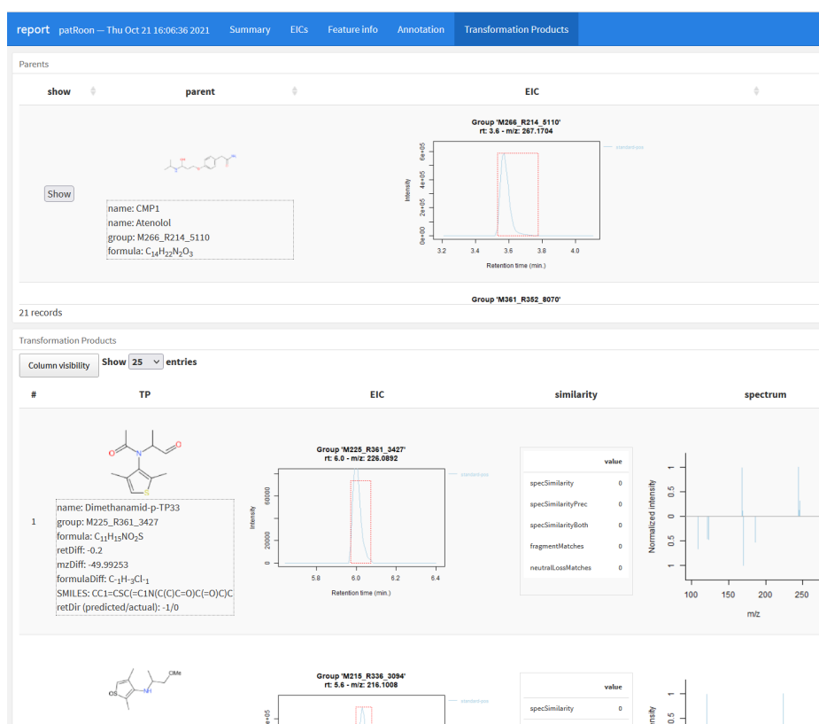
Figure 2: Example report with TP screening results (bottom) for a selected parent (top).