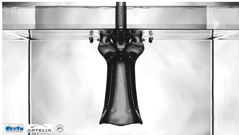
Figure 3: A cylindrical liquid jet glycerol surrounded by silicone oil plunges into a bath of glycerol. Simulation made with OpenFOAM by ARTELIA and LEGI (Laboratoire des Ecoulements Géophysiques et Industriels). Rendered in Blender using NIMPHS.