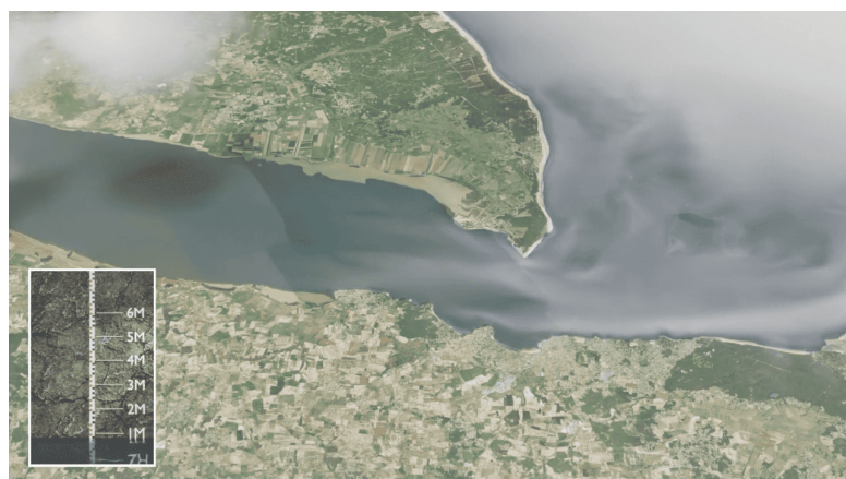
Figure 1: The visualized model is the Gironde estuary, France. Simulation made with TELEMAC-2D by ARTELIA and post-processed using NIMPMS in Blender.