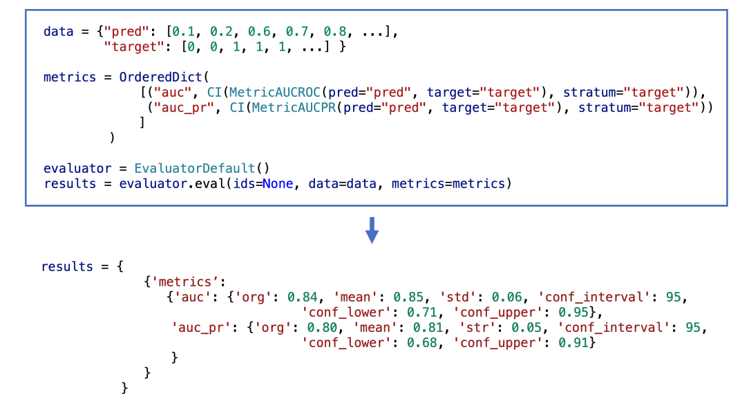
Figure 4: In this example a pipeline of evaluation metric components is shown. It consists of two metrics: the Area Under the receiver operating characteristic Curve and the Area Under the Precision-Recall Curve. Both metrics are wrapped with a Confidence Interval (CI) metric, resulting in a lower and upper bound for each metric. The metrics are executed by an instance of the EvaluatorDefault class, the basic fuse.eval class that combines input sources, evaluates using the specified metrics, generates a report and returns a dictionary with all the metrics results.

FuseMedML's evaluation package is a standalone library for evaluating machine learning models using various performance metrics and comparing the results between models. It offers advanced capabilities such as a generic confidence interval wrapper for any metric, a generic one-versus-all extension for converting any binary metric to a multi-class scenario, and metrics for comparing models while considering statistical significance. The package also includes model calibration tools and a pipeline for combining a sequence of metrics with possible dependencies. In addition, the evaluation package supports automatic per-fold evaluation and subgroup analysis, and can handle large data sets through batching and multiprocessing. See Figure 4 for an example of an evaluation metric pipeline that can be reused across projects.