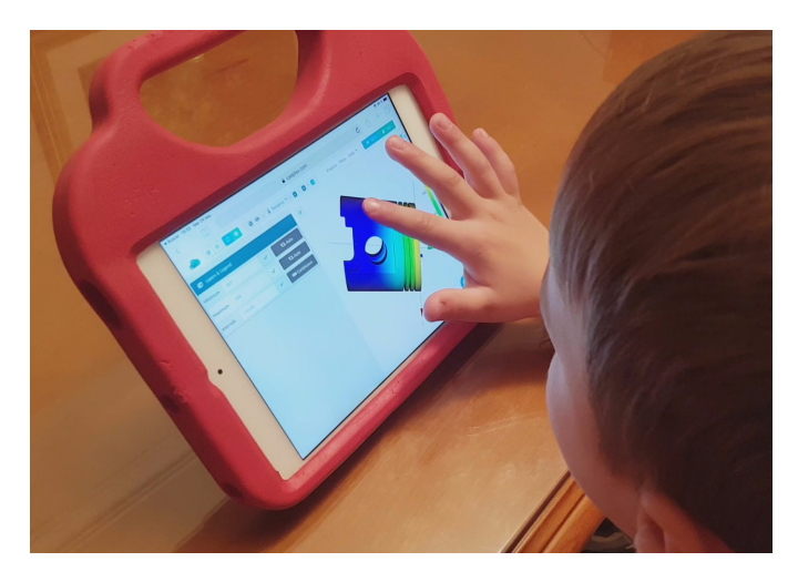
Figure 2: CAEplex is a web-based interface to solve thermo-mechanical problems in the cloud that uses FeenoX as the back end.