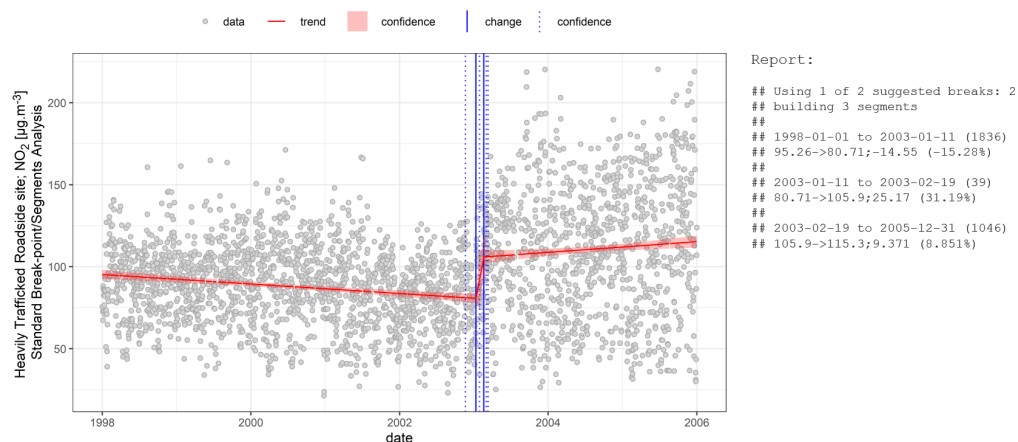
Figure 2: Standard AQEval break-point/segment analysis (graphical output and report) of an \text{NO}_2 1998-2005 time-series from a heavily trafficked roadside in the UK.

Figure 2 shows the break-point/segment analysis of an \text{NO}_2 time-series from a roadside site where a change event (ca. 25 \mu\text{g.m}^{-3} ; 31%) is detected between 2003-01-11 and 2003-02-19.