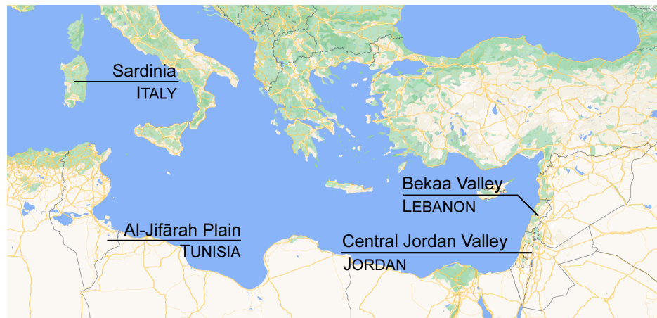
Figure 3: Map of the Pilot Locations of the ACQUAOUNT Project.

The ACQUAOUNT Project has many lines of research and development, such as sensor installation, LoRaWAN networks, or basin modelling. WoT-Server acts as the link between the sensors and platforms and the models, storing data and providing functionalities in a standardized way. WoT-Server stores the data received from the data sources and provides it to services that calculate recommendations based on this data. Once the services finish the calculations, the results are also stored in WoT-Server to be consumed by the dashboard and frontend services to be displayed to the final users in a graphical and understandable way.